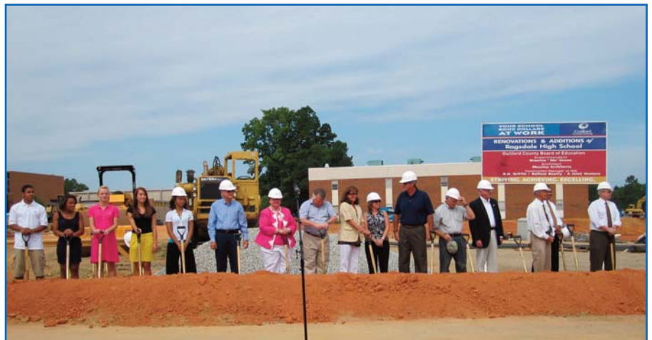
Ground Breaking Ceremony - Ragsdale Renovations and Additions